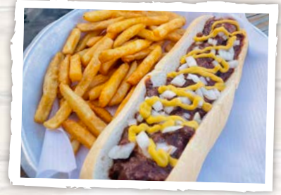
CONEY ISLAND DOG

Foot long beef frank topped with no bean chili, diced onions, and mustard. $9.95